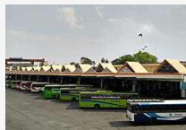
MGBS Station to Venue - 9.6 KM