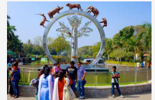
Nehru Zoological Park