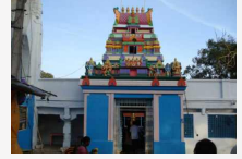
Chilkur Balaji Temple