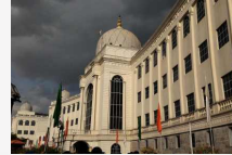
Salar Jung Museum