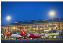
Airport to Venue - 37.7 KM