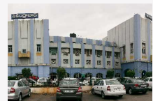
Secunderabad Railway Station to Venue - 4.9 KM