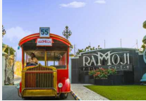
Ramoji Film City